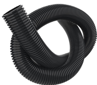
HPFLEX® SOLAR BLACK